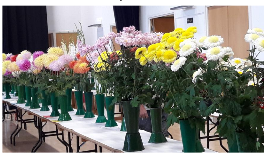
Quality of the Show was exceptional

Bishop Auckland Horticultural and Produce Show