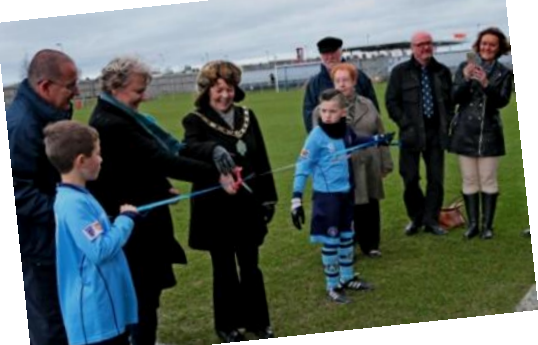
Official opening of new facilities Bishop Auckland Football Club