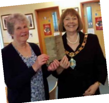
Launch of Lingford & Gardiner exhibition