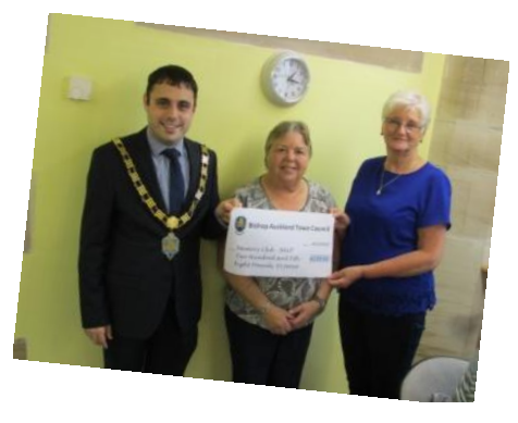
Cheque presentation to Memory Club