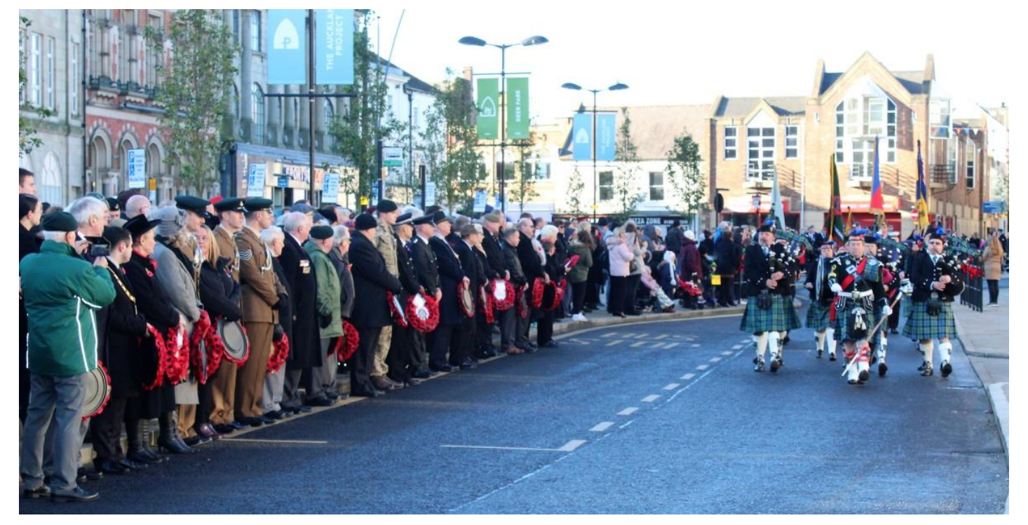
Pipes, drums and a parade was held for the first time in over 20 years at the 2017 Remembrance Service

As custodians of Remembrance, each year the Royal British Legion calls on the nation to unite in commemorating Remembrance Sunday.