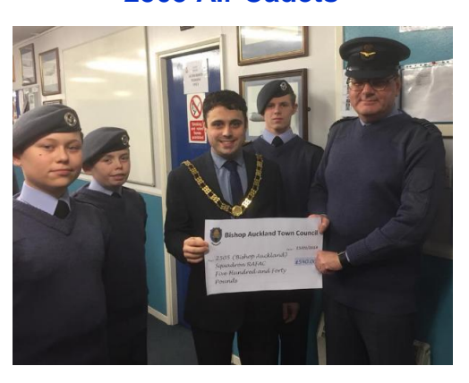
The Mayor with the 2505 Air Cadets

The 2505 (Bishop Auckland) Sqn ATC was awarded £540 to assist with a month long programme of events in April to mark the 100 year centenary of the RAF, including a memorial service at St Anne's Church and raising the RAF Ensign on the Town Hall Balcony. The squadron which consists of thirty cadets and eight adult staff volunteers is based at the Army Reserve Centre in Bishop Auckland also does a fantastic job of supporting the local area, veterans and the public.