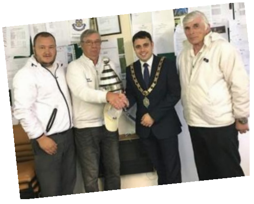
Presentation at Bowls Club