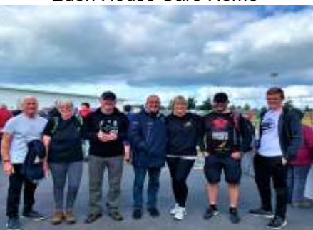
A 26 mile sponsored Walk for Angel Trust and Prostate Cancer UK