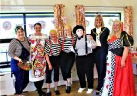
Celebrating Art in Care -Bishopsgate Lodge Care Home