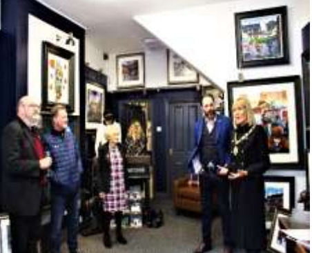
Opening of 'House of Smudge'