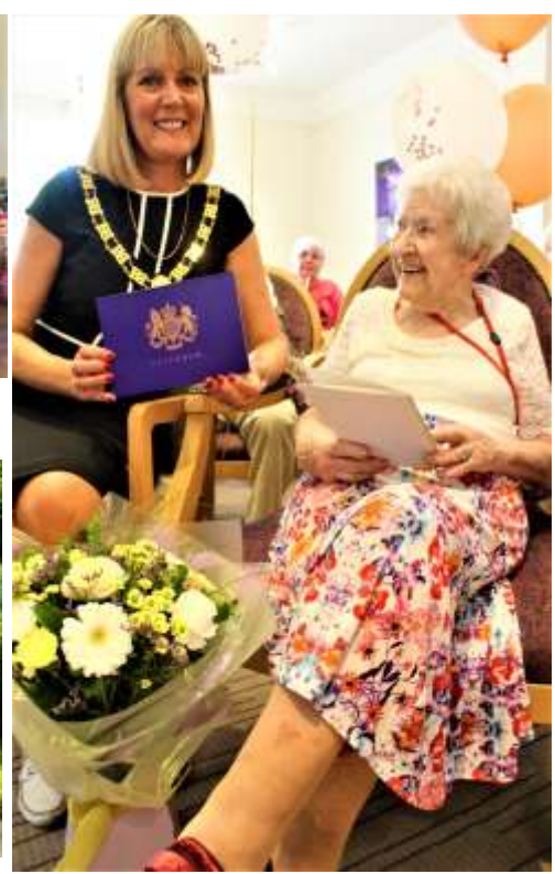
100th Birthday Celebration