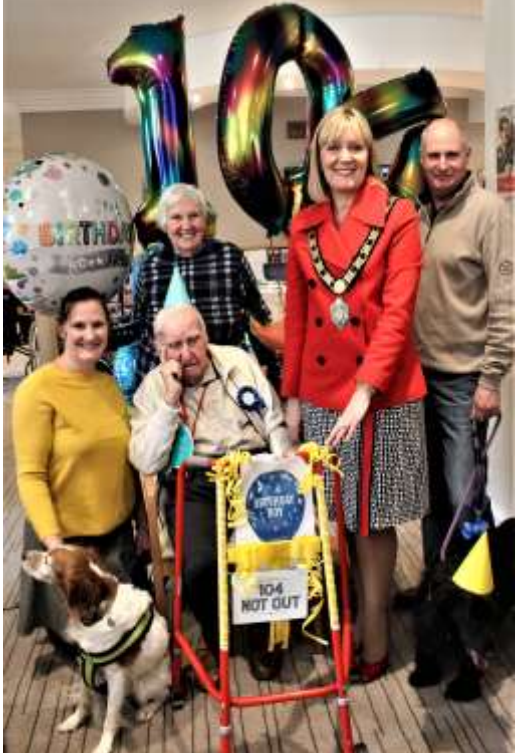
104th Birthday Celebration