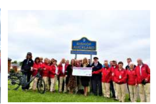
Bishop Auckland recognised as WorldHost Destination