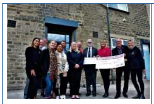
Mayor presents Community Fund Grant to the Angel Trust

The following are just some of the community groups that have received grants during 2019/20 financial year showing the variety of projects that can be assisted.