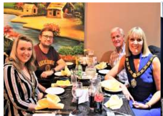
Mayor's Curry & Quiz Night